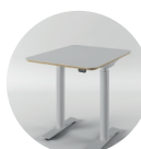
ADJUSTABLE HEIGHT TABLE