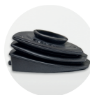
ADJUSTABLE MICROSCOPE STAND (5° - 25°)