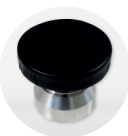
INTERNAL WRIST REST